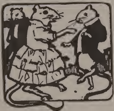
They Gave a Ball in Their New Home.

“YOU know,” said daddy, “there are kinds of mice called the waltzing mice.”